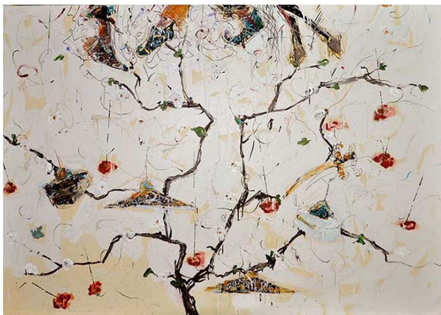
Mohsen Jamalinik , Untitled 3 , 2014, 140 x 200 cm, Acrylic on canvas

Mohsen Jamalinik b. 1979, Tehran, Iran. Lives and works in Tehran. Recent exhibitions include Sibour , Aun Gallery Tehran, 2015 From Persia with Love , Nicholas Flamel, Paris, 2014, Flowers of Freedom , Manouchehri House & Aun Gallery, Kashan, 2014.